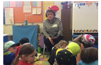
Read Across America Day!