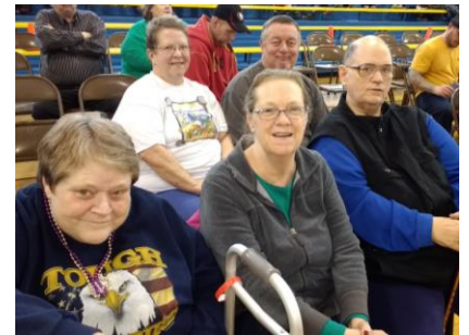
Guest from Sunnycrest enjoying the Marshall Music Program