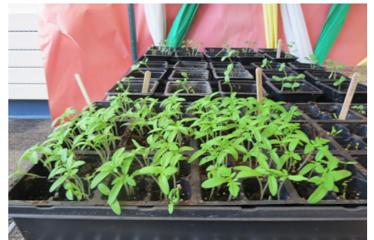
Starting our plants for the garden!