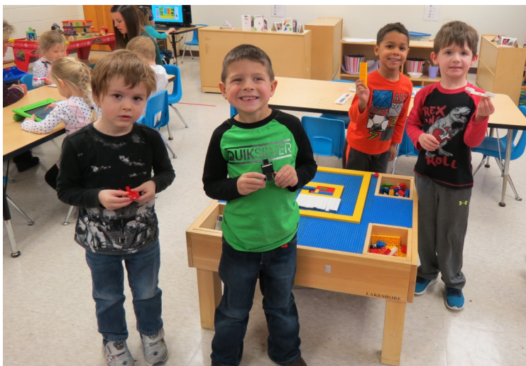
The Lego table in Preschool is a big hit during station time!

9:45 Late Start PTC Movie Night "Secret Life of Pets" 6:15 Doors Open 6:30 Movie Starts No admission fee! Students need to be accompanied by an adult. Wear your pajamas and bring a blanket or chair. Concessions available for purchase.