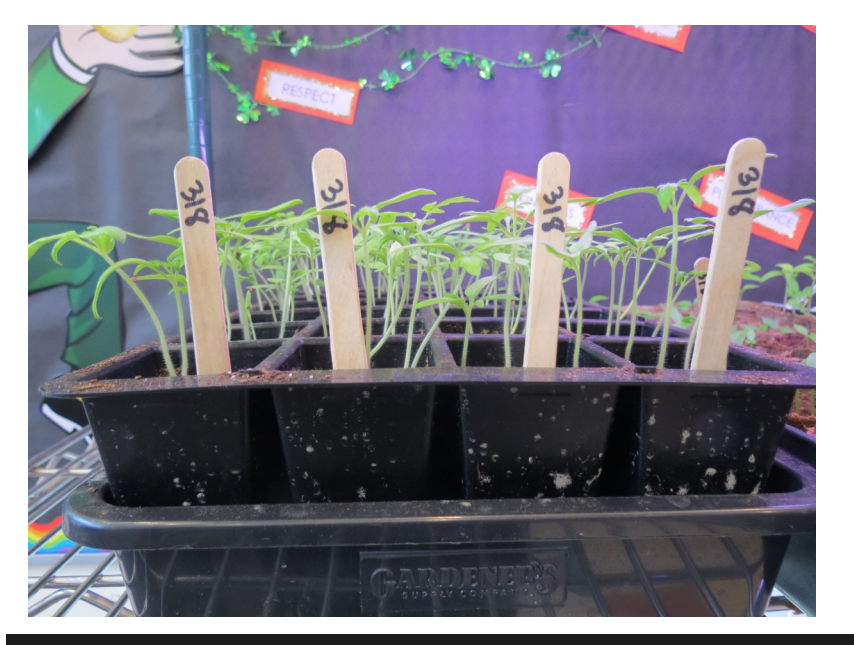
Everyone is enjoying how fast our plants are growing for the school garden!