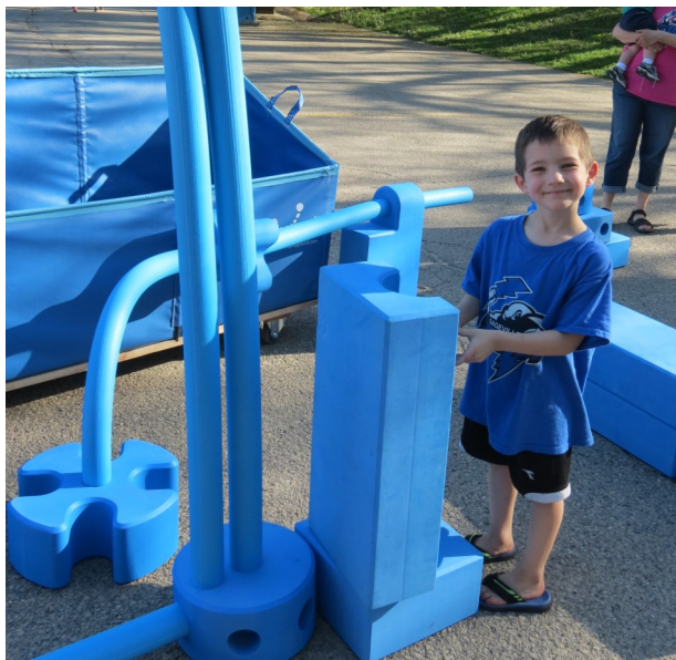
Lego Land was a new addition to Spring Fling this year!