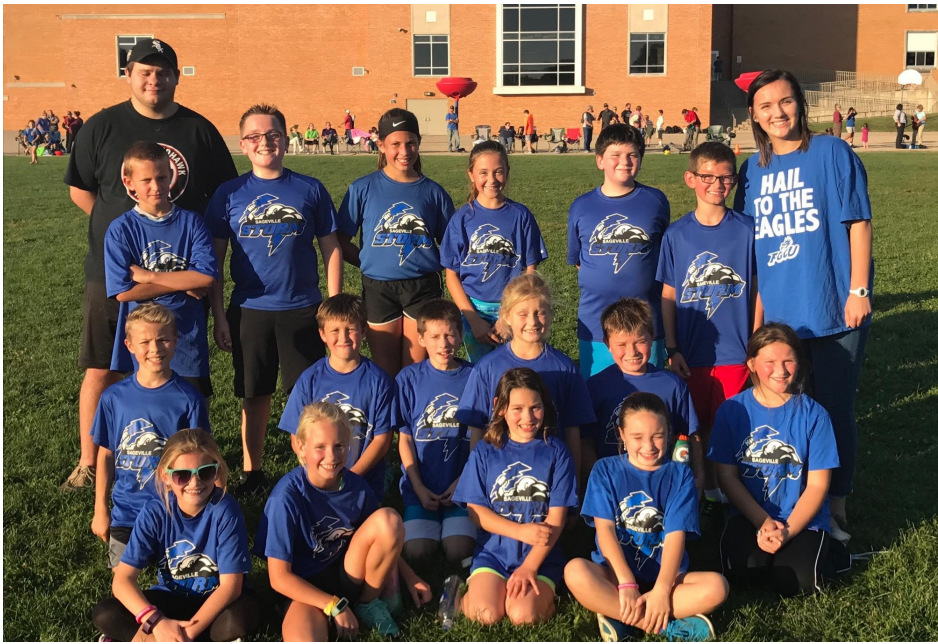
Soccer this fall was a big hit with 4th & 5th graders!