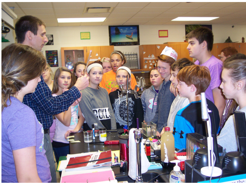
“Students learn about a piece of lab equipment called a buret.”